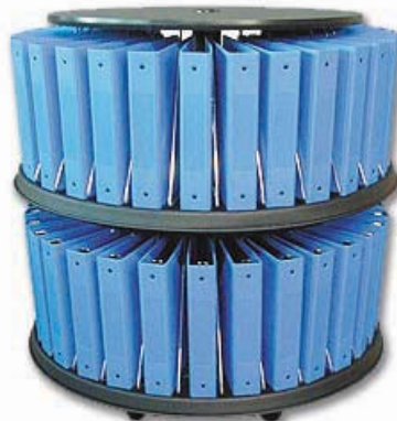
SKU # RTBC-60CT