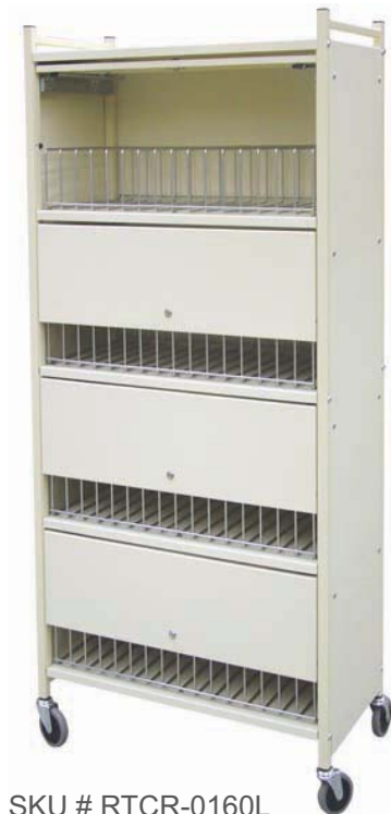
SKU # RTCR-0160L