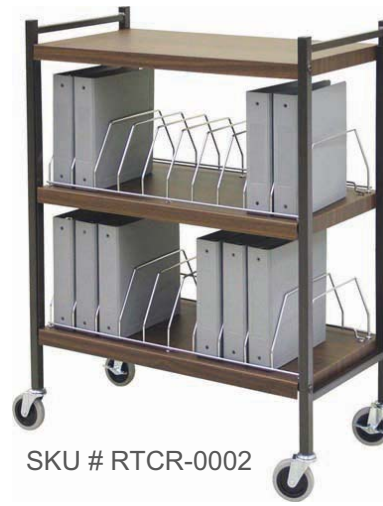
SKU # RTCR-0002