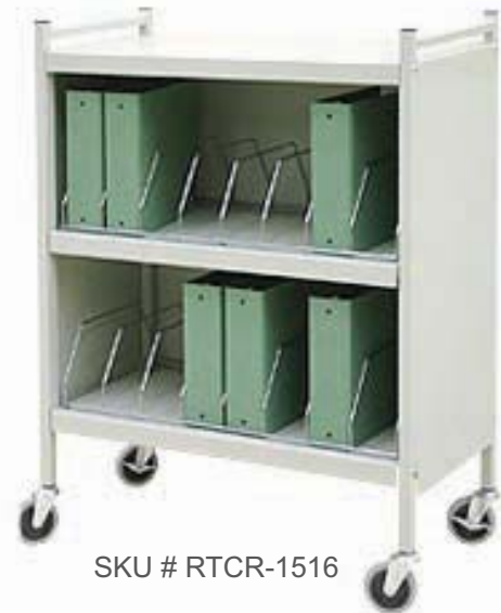
SKU # RTCR-1516

LOCKING PANELS FOR CABINET STYLE RACKS DESIGNATED BY "L"