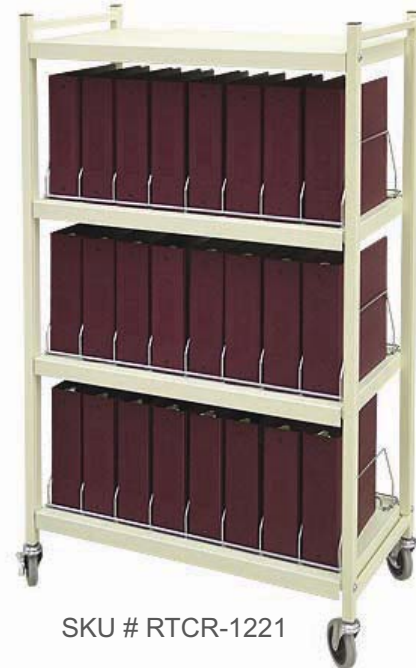
SKU # RTCR-1221