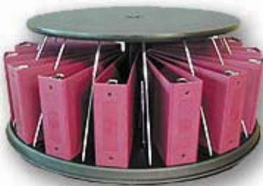
SKU # RTBC-30CT