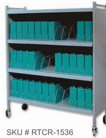
SKU # RTCR-1536