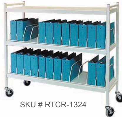
SKU # RTCR-1324